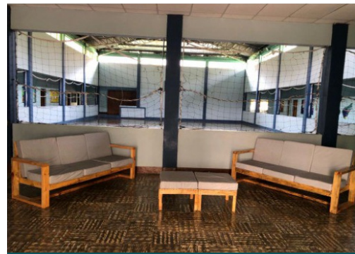
Sofas and tables for the lobby.