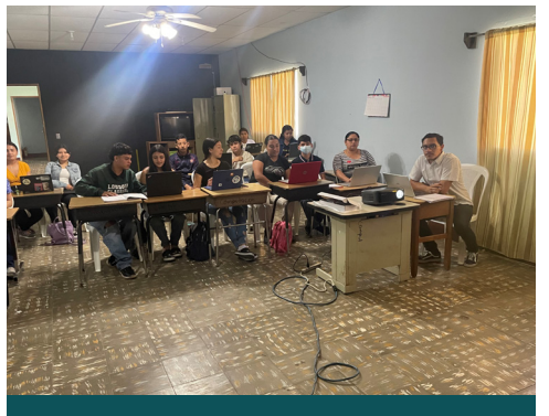
Provided 10 new laptops for our students

For the Lord is good and his love endures forever; His faithfulness continues through all generations. Psalms 100:5