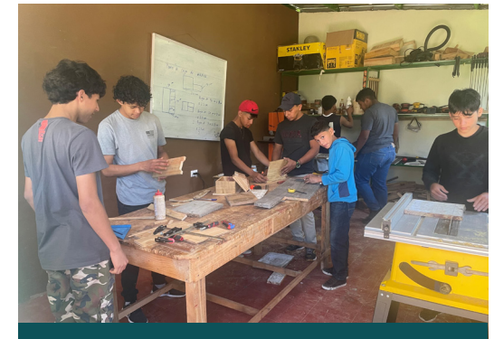
Helped us upgrade several tools and machines for our popular wood working class