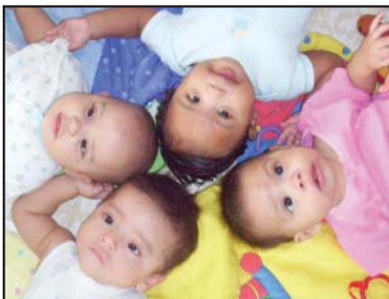
Circle of Love 2008