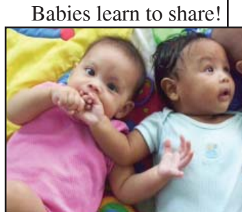
Babies learn to share!